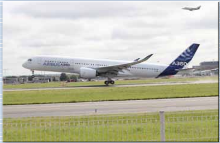
This maiden flight marks the beginning of a rigorous test flight campaign involving five A350s, and around 2,500 flight hours. It will culminate in the aircraft's certification followed by its entry into airline service in the second half of 2014 with first operator Qatar Airways.

Airbus President and CEO Fabrice Bregier said: "I congratulate the whole A350 XWB development team for having completed the first flight preparation in a record time. I also wish to thank the first flight crew today for taking this aircraft where it wants to be - in the sky." He added: "I would also like to extend my gratitude to all our teams in the design offices, at programme and manufacturing level, the ground crews as well as our colleagues in airlines and suppliers and many others who helped define this all-new aircraft. The A350 XWB which has flown today, integrating the latest available technologies, is now entering the final stage of its development. And it is ready. Ready to head towards certification and entry-into-service in the second half of next year." For its first flight, the A350 XWB - carrying the registration F-WXWB - took off at around 221 tonnes. During the flight, which took the aircraft around south western France, the crew explored the aircraft's flight envelope. The aircraft was accompanied by a chase plane to observe and film the various manoeuvres. Its progress was monitored by experts on the ground in real-time via a direct telemetry link.